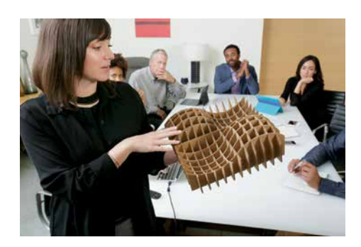
For razor sharp close-ups of objects and whiteboard content, the GROUP camera offers 10x lossless zoom enabling your team to see every detail with outstanding resolution and clarity.

GROUP offers the flexibility to customize conference room set-up with multiple camera mounting options. Use the camera on the table or mount it on the wall with included hardware. The bottom of the camera is designed with a standard tripod thread for added versatility. Conference participants can also clearly converse within a 6m/20' diameter around the base, or extend the range to 8.5m/28' with optional expansion mics.